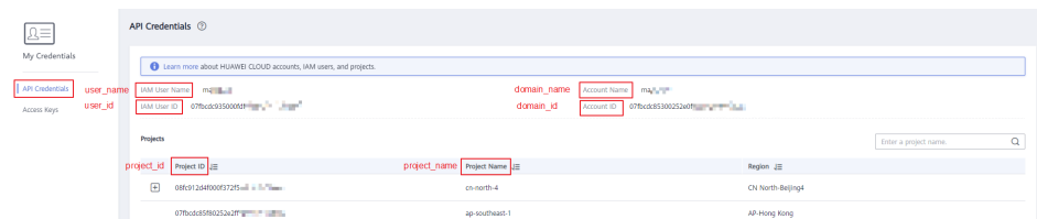
Figure 6-2 Viewing the account, user, and project information